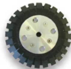
SP-15 Stainless Steel Wheel